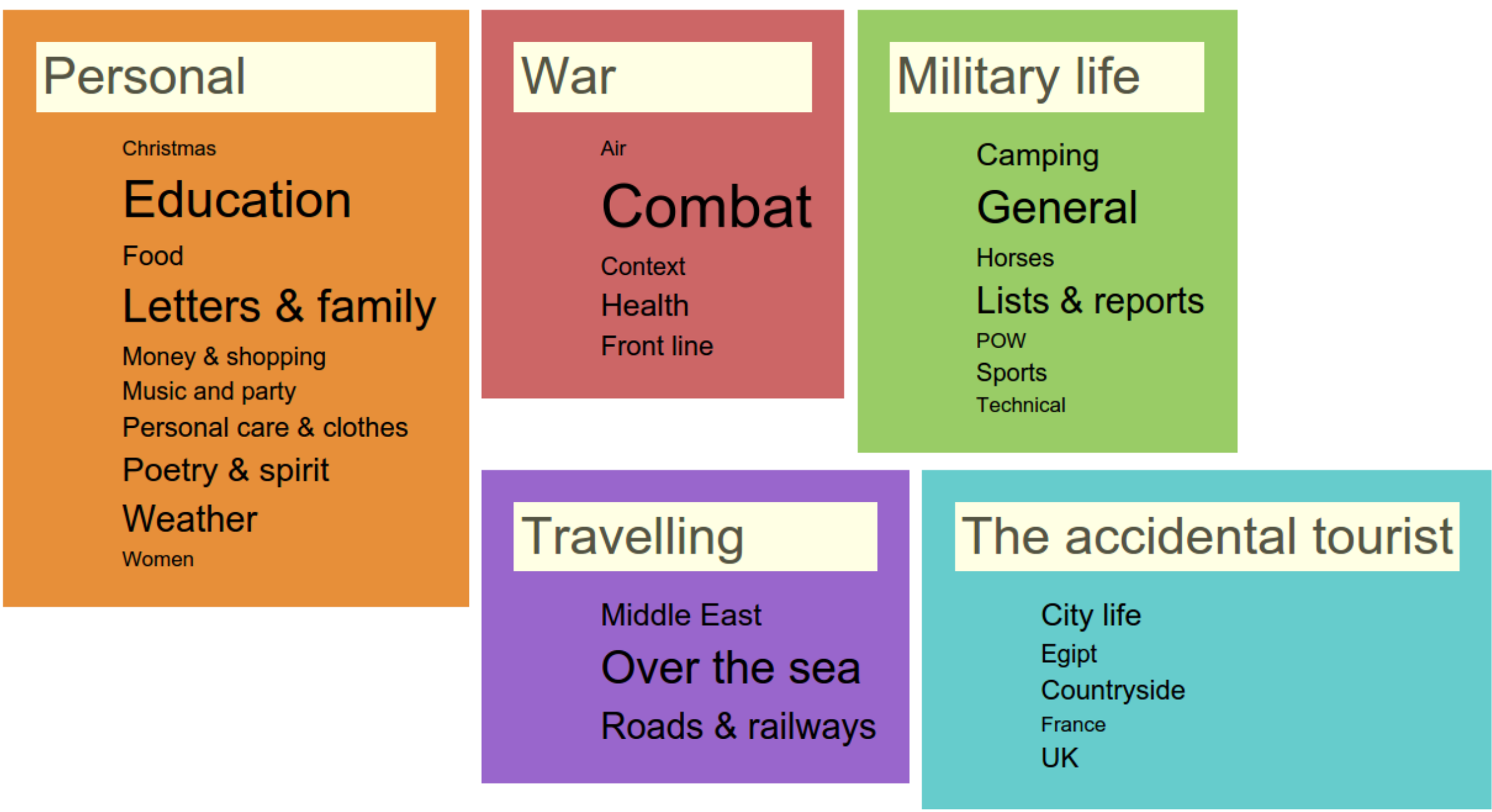
Two level menu, with thirty topics in five group